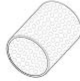
Filter A304 with bands A321