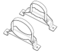
Brackets horizontal setting A304 and screws A321