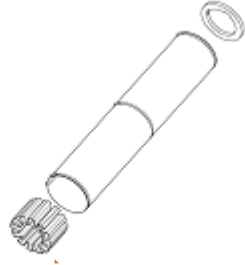
Cooling shroud A304 with bands A321 Motor centring ring A304 Pump centring ring SBR/NBR rubber